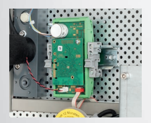
Gasdetector (% LEL CH<sub>4</sub>)

for continuous monitoring of atmosphere in cabinet